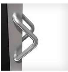
Triangular handle with concealed attachments. Height 300 mm, Ø 30 mm. Aluminum.