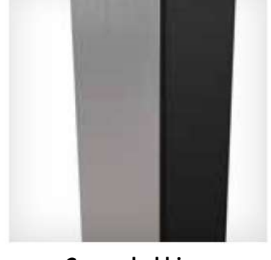
Concealed hinge 14059, 14065

- cannot be used in the system SAPA 2086 Plus and Extreme.