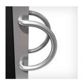
Semicircular handle with concealed attachments. Height 300 mm, Ø 30 mm. Aluminum or stainless steel.