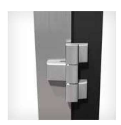
Universal hinge Dr Hahn - 14090, 14091, 14092.