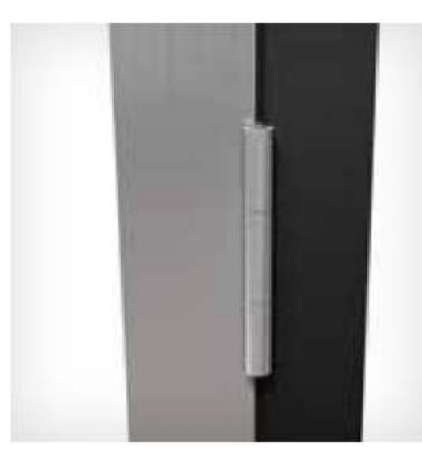
Lap butt hinge 14072,14094 H<sub>max</sub> = 2400mm L<sub>max</sub> = 1250mm