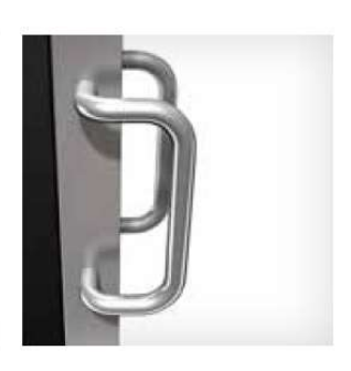
Offset handle with concealed attachments. Height 300 mm, Ø 30 mm. Aluminum.