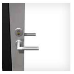
Lever handle for inner door Lever handle, knob, rosette and cylinder rosette with modular profile. Width 137 mm, Ø 21 mm.